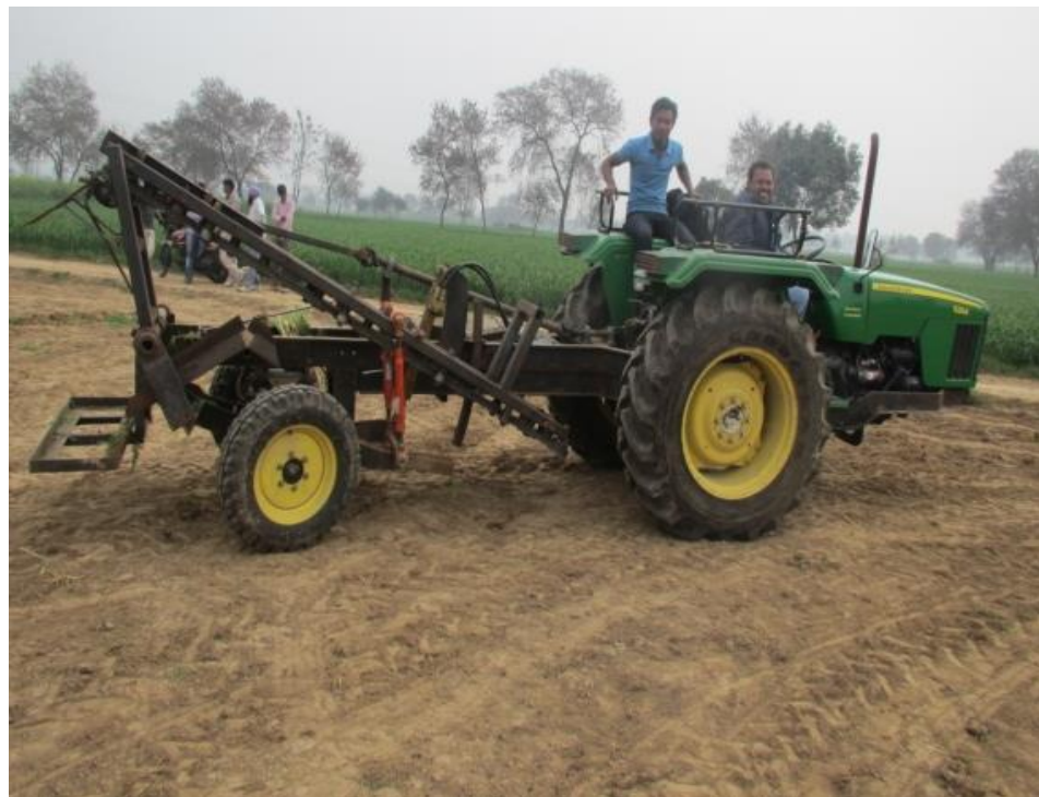
Developed carrot digger