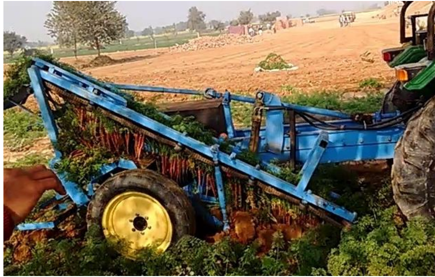
Ttractor operated single row carrot digger in operation